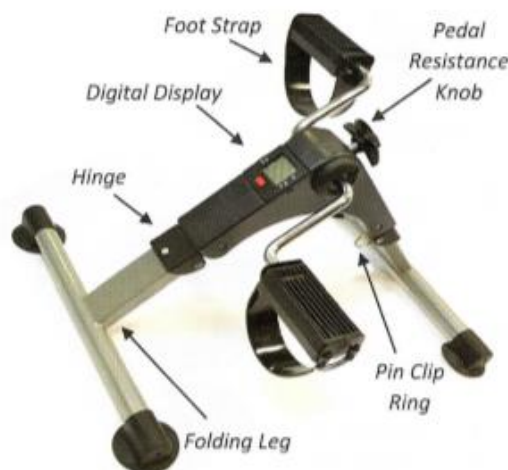
Figure 1 – Pedal Exerciser M37352

Check the legs are secure and place the exerciser on the floor in front of your chair at a comfortable distance.