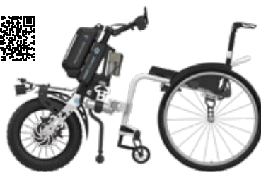
ICON 60 with PAWS