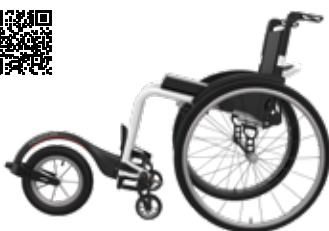
ICON 60 with TRACK WHEEL