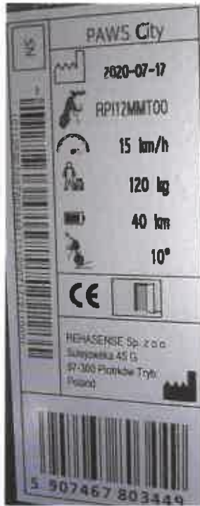
PHOTO OF WHEELCHAIR