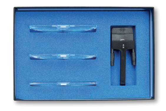
934001 RIDO-Clip set with all lens parts Contents: Clip and one lens part each in 3.0 D, 5.5 D, 7.0 D