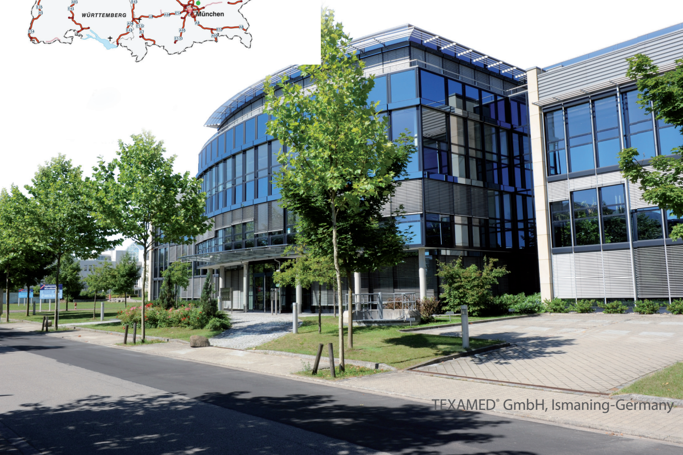
TEXAMED® GmbH, Ismaning-Germany