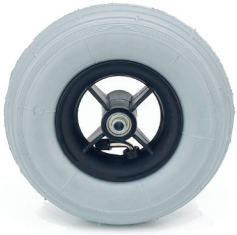
Pneumatic front castors 8" x 2"