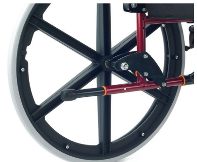
Double amputee kit