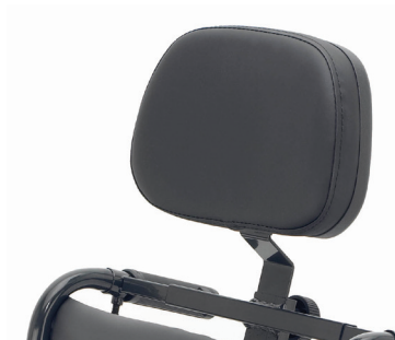
Sky headrest assembled on nylon upholstery