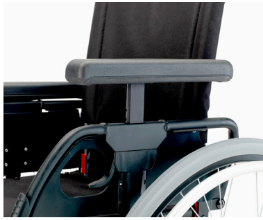
Height adjustable armrest