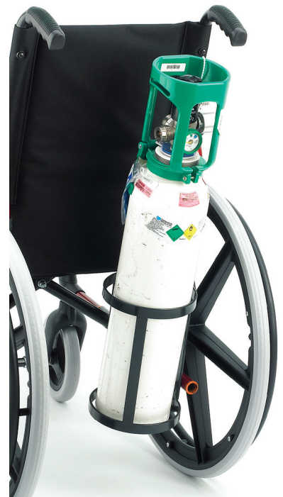
Oxygen bottle holder