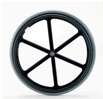
Pneumatic mag rear wheels 24"