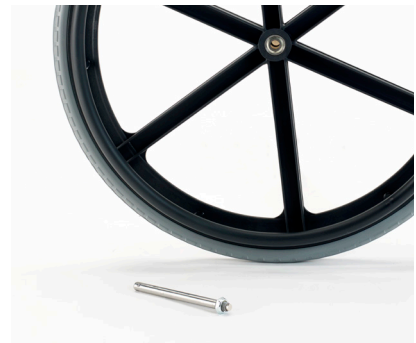
Quick release axle on rear wheels