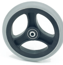
Slid front castors 6"