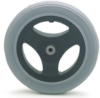
Solid or Pneumatic rear wheels 12"