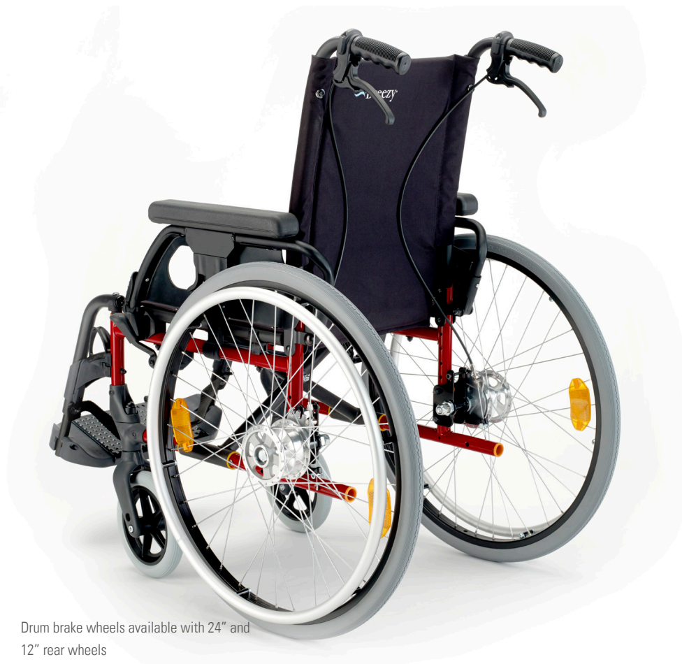
Drum brake wheels available with 24" and 12" rear wheels