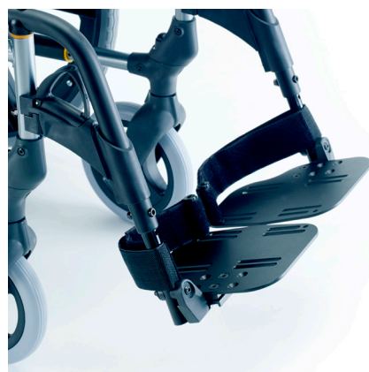
Aluminium angled adjustable footplates