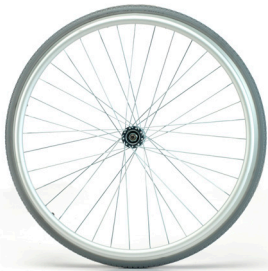
Slid or Pneumatic spoke rear wheels 24" or Pneumatic spoke wheels 22"