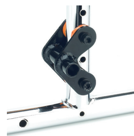
Set back Center of gravity -50mm More stable