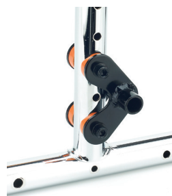
Set forward Std. position at the center of gravity (+25mm). More active

Breezy Premium can achieve 3 different seat height (50,5, 48 o 45,5 cm). The height depend on the rear wheels and castors