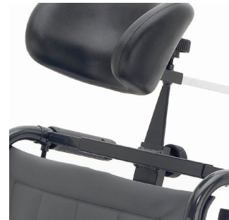
Anatomical headrest assembled on anatomical backrest