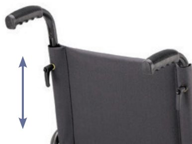
Height adjustable handles