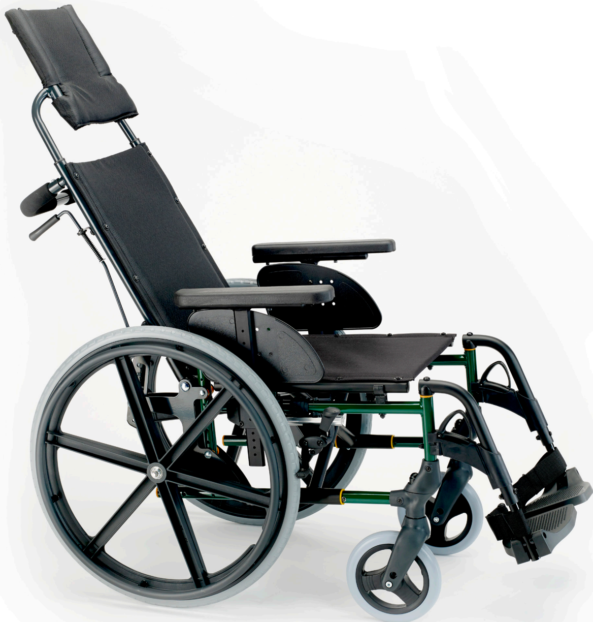
Standard configuration with upholstery recline headrest and (optional) detachable axles