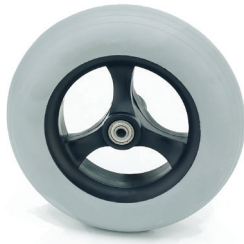
Slid front castors 8" x 2"