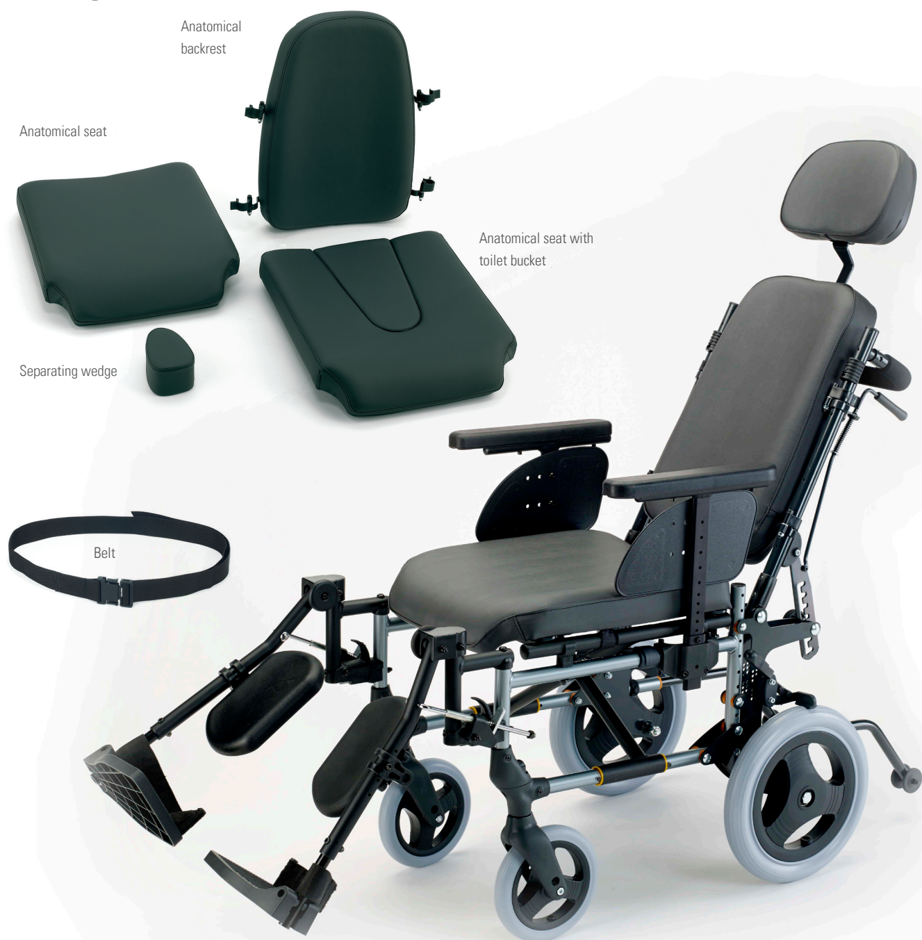
Breezy Premium model with reclining backrest and anatomical seat and backrest