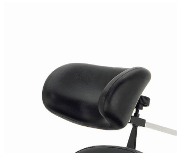
Anatomical headrest assembled on nylon upholstery