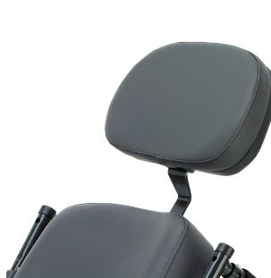
Sky headrest assembled on anatomical headrest