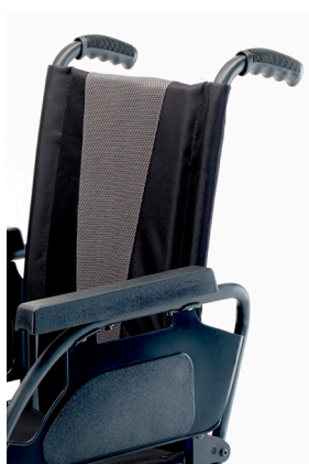
Breathable Vented upholstery