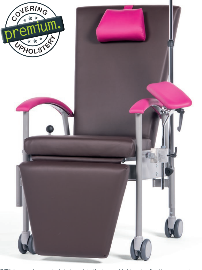
SITA in premium material chocolate/fuchsia with blood collection armrest on the standard rail and infusion rod in holder