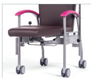
Robust base with smooth-running