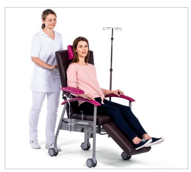
SITA - perfect for patients and caregivers

Operation is as simple as it is convenient: when the right-hand operating lever is pushed back, the mechanism unlocks the backrest and can be steplessly moved horizontally. When discharged, it self-aligns thanks to a pneumatic spring. The forward lever position regulates the leg rest, also supported by a pneumatic spring. Perfect ergonomics for patients. And helpful relief for the nursing staff, whose tasks are best supported by a stable base with capacity for 220 kg patient weight, individually steerable 10 cm castors and a handle on the mobile model, as well as accessories such as phlebotomy armrest, infusion rod, patient table and the standard bars for attaching individual utensils.