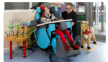
Disability Care Positioning