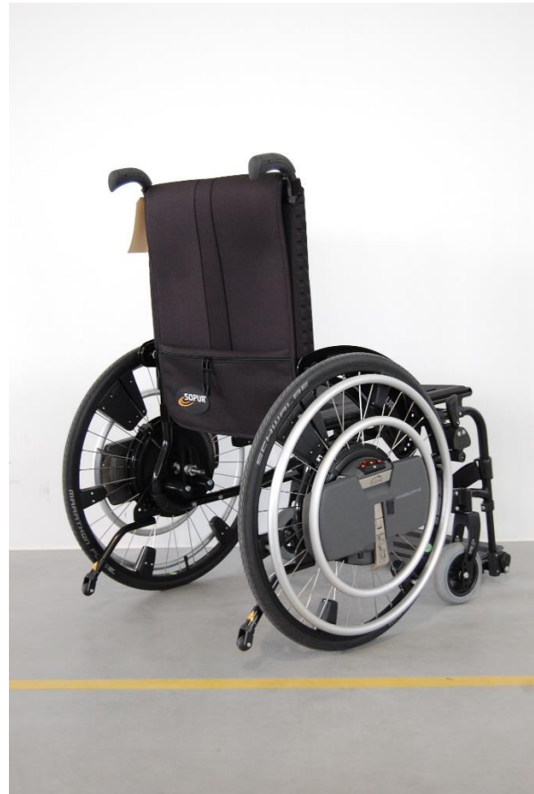
Pictures of the tested sample, trade mark: Quickie, type: Easy Life, version: 07200100, in combination with the electrical power assist with trade mark: WheelDrive, version: E1801, manufactured by INDES B.V.