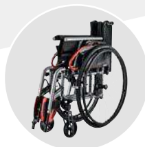
Narrow folding dimensions 280 mm at 0° and 330 mm at 3° wheel camber, height from 650 mm