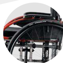
Side panel with height-adjustable armrest, one-handed operation (optional)